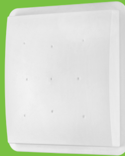
UHF 5 series