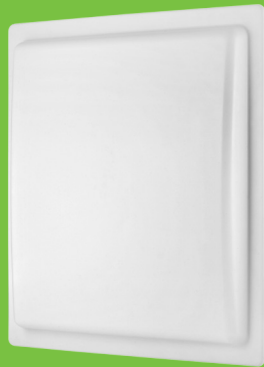
UHF 10 series